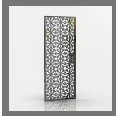
Decorative MS Laser Cutting Service