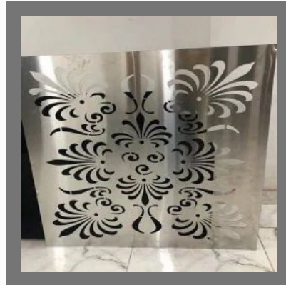
CNC Sheet Metal Cutting Services