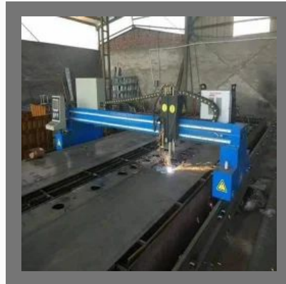
Iron Laser Cutting Service