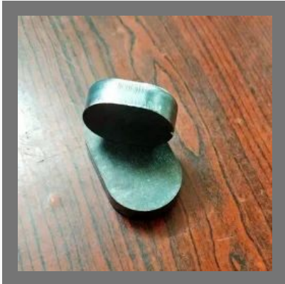
Laser Cutting Service