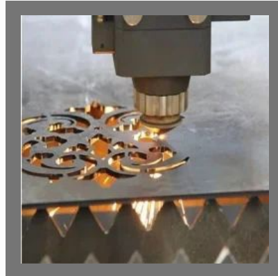
Decorative Laser Cutting Service