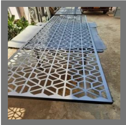
MS Laser Cutting Service