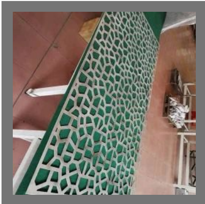
Sheet Laser Cutting Service